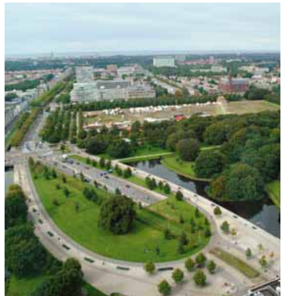
Biodiversity, CO 2 reuse, and purifying air and water are measurable in parks and landscaping.

Milestones can be plotted along the vertical and horizontal axis of a C2C Roadmap. One axis describes the level of benefits for stakeholders. The other axis shows the Defined Use Period for the building. See Fig. 1.