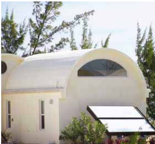
Resilient, cool, and self-sufficient. Hurricane-proof solar powered buildings.

Practical functions performed in a building are often quantifiable, such as manufacturing, recreation and residential housing.