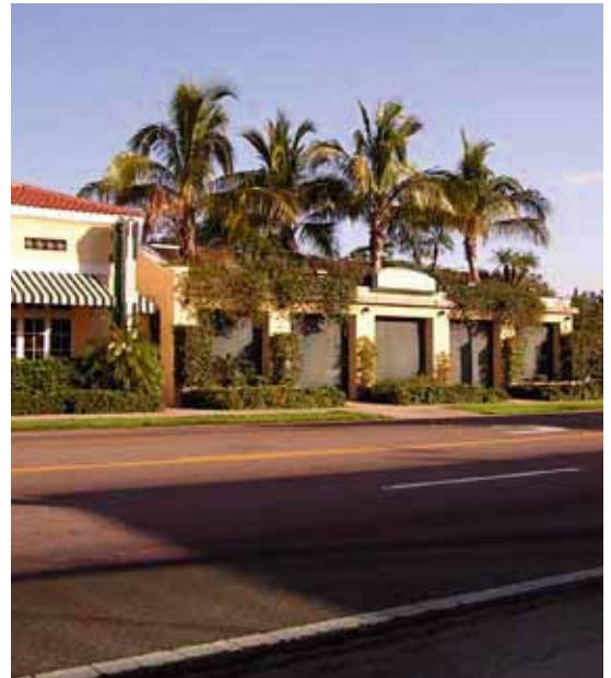
Coconut for dessert? Get it from the roof. Green roof innovation at a restaurant enhances value and enjoyment.

Examples. Make areas safe for children. Make meeting areas accessible. Provide ready access to outdoors and fresh air.