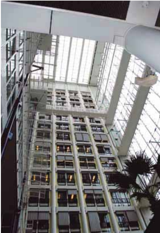
Atria integrate C2C principles by recycling nutrients, using solar income, and celebrating innovation and biodiversity.

Criteria and tools for applying the Principles and Definition are described in the next sections.